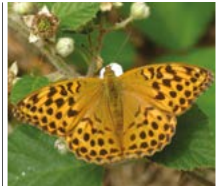
Right: Female Silverwashed Fritillary