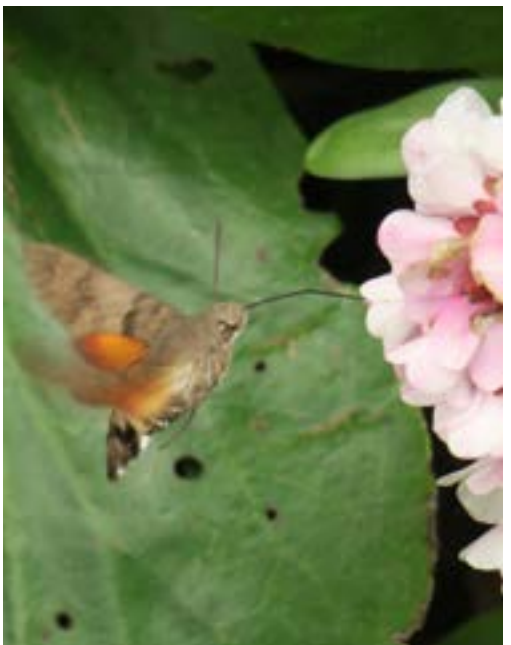
Hummingbird Hawk-moth