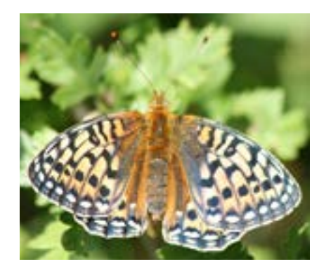
Right: Female Dark Green Fritillary