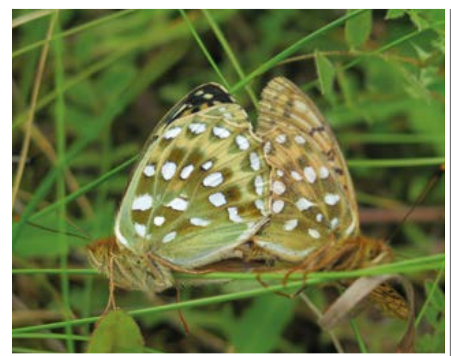
Right: Mating Dark Green Fritillaries

periods 1995-1999 against the period 2000-2018, it can be clearly seen that the species is moving north to new areas within the County and indeed during 2019 the DARK GREEN FRITILLARY was noted on the transects at Lightwood above Buxton, the Longshaw Estate at Padley, the eastern moors at Curbar and in the far north western part of Derbyshire in Longdendale near Hayfield. However, individuals of the species noted in North East Derbyshire are probably as a result of unauthorised introductions.