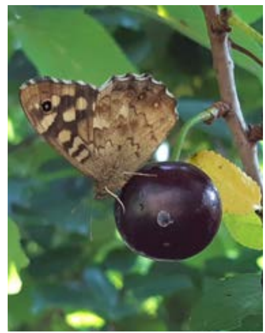
Speckled Wood