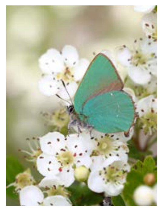
Green Hairstreak