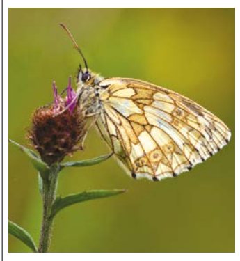
Marbled White

I had spent the previous few days frantically watching the weather forecast as it varied from potentially being cloudy with intermittent sunny spells to heavy rain for the whole of the afternoon. Fortunately, the former turned out to be correct A temperature of 20 degrees accompanied by a gentle northerly breeze turned out to be ideal conditions.