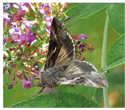
Silver Y moth