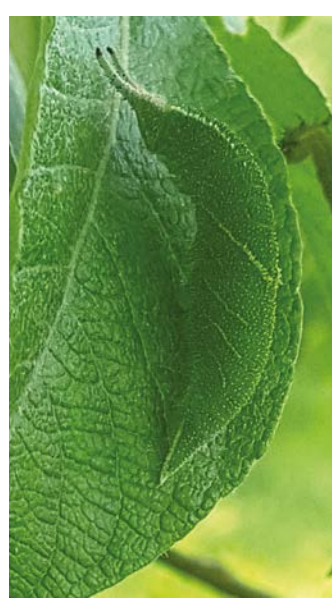
Figure 3. Larva, L5 Instar

Broad-leaved Salix species are the favoured host plants, particularly the Goat, White and Grey Willow. The Purple Emperor has a single generation each year (termed univoltine) flying in Britain from mid-June to early August. Each year after mating the females lay their eggs on the upper leaf surfaces of the host species in shaded locations bordering rides or clearings. On hatching the small caterpillars sit facing inwards on the leaf tips and undergo successive moults in autumn developing their characteristic horns (Figure 3). After being dormant over winter the caterpillars start to feed again on the leaves until in June, then they move and form a chrysalis on the underside of a suitable leaf, followed shortly by emergence of the imago (adult) to complete the lifecycle.