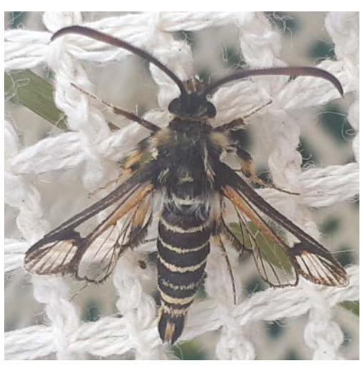
Six Belted Clearwing at West Hallam Tip

Of the fifteen clearwing species recorded nationally, we have ten in the East Midlands, of which only Lunar-hornet clearwing is at all widespread, across all four counties but even this is still regarded as of conservation concern. Nottinghamshire has a Nationally Important population of Welsh clearwing in Sherwood Forest, with two other English locations; in Cannock Chase in Staffordshire and a site in Cumbria. Welsh clearwing and all of the other eight clearwing species are also classified as