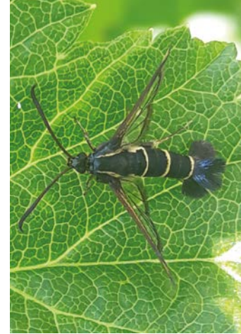
Above: Currant Clearwing (Photo Melanie Penson)

Left: A pheromone lure in action (Photo Melanie Penson)