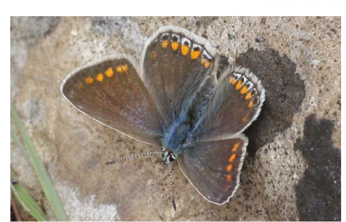
Female Common Blue

We visit many NGS Open Gardens and this has to be one of the best for biodiversity. The large patio which over overlooks part of the garden was laid out with tables and chairs where you could enjoy some of delicious homemade cake on offer. The owners are involved with The Friends of Bestwood Park and their cakes can also be sampled at the small café near the old working in Bestwood Village which opens on a Saturday morning. If the owners are considering opening next year, which I sincerely hope they do, this garden is highly recommended and definitely not to be missed.