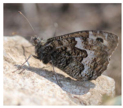
Grayling, on The Great Orme, North Wales