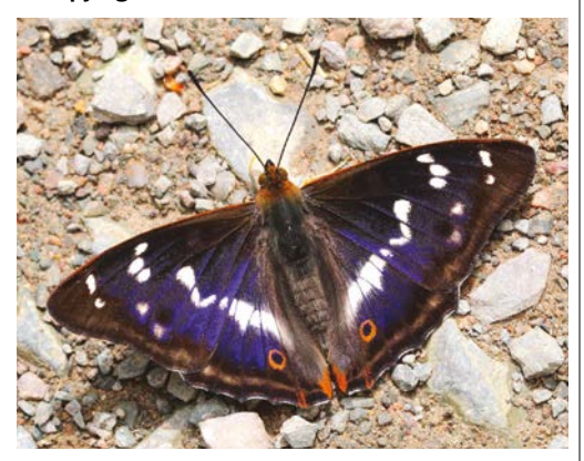
Figure 1. Male Purple Emperor

he nymphalid Purple Emperor (Apatura iris) is our second largest British butterfly, named for the iridescent purple sheen seen on the male's wings when they refract light at a certain angle (Figures 1-2). It is widespread at mid-temperate latitudes across Eurasia, as far east as China. In Western Europe it is absent from the warm Mediterranean and cool Scandinavian regions occupying the broad belt in between.