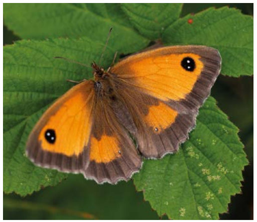
Gatekeeper, Attenborough Nature Reserve