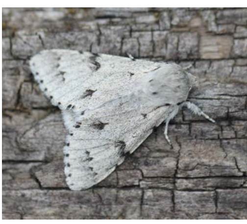
Miller moth, Glenfield