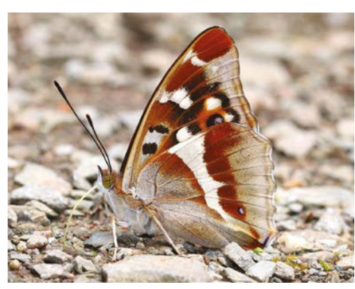
Figure 2. With wings folded

It is a butterfly of deciduous woodlands with clearings and rides, the males in particular are very active: they seek out territories which are often on clumps of trees at high points in woods. There they seek to claim a tree or trees from which to look out for fresh females flying by at a lower trajectory; if another male encroaches on their territory, a fight ensues, involving the two of them spiralling high into the air circling each other, until one gives up and leaves. This is a magnificent sight! The males in particular often come down to the ground, where they feed on minerals and excrement.