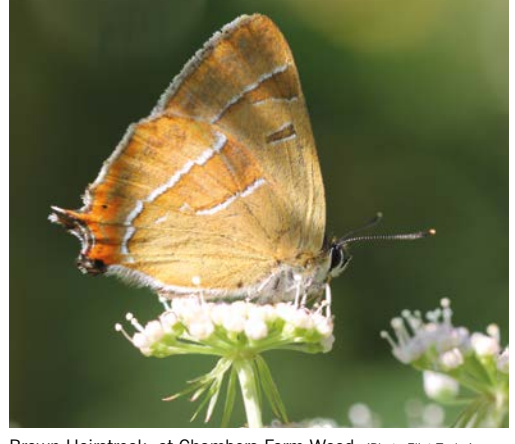
Brown Hairstreak, at Chambers Farm Wood, (Photo Eliot Taylor)