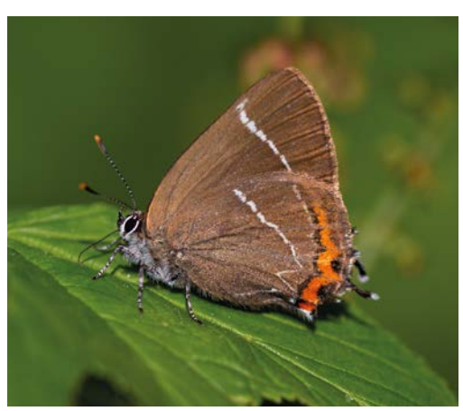
White-letter Hairstreak at Cloud Wood