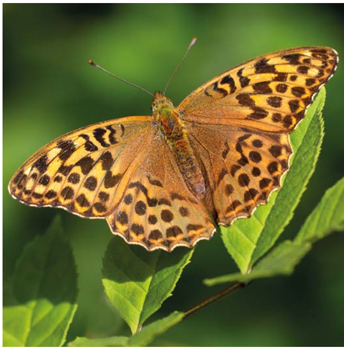
Silver-washed Fritilary at Cloud Wood

Butterfly Recorder for Leicestershire & Rutland