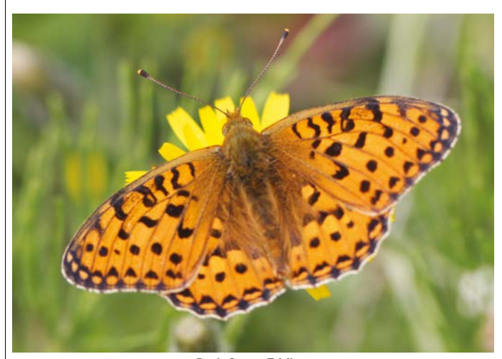
Dark Green Fritilary