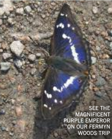
SEE THE MAGNIFICENT PURPLE EMPEROR ON OUR FERMYN WOODS TRIP